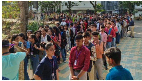
Students waiting for aakanksha fest to begin outside the venue.